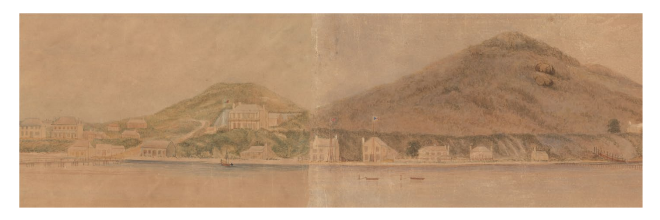
Figure 2 Panorama of Albany by William Clifton c1861 showing Norman House (then Bellevue) prominently to the left of centre.